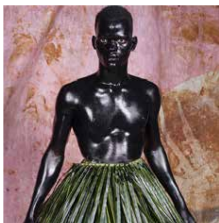
Cimarron , Charles Fréger, Château of the Ducs of Bretagne