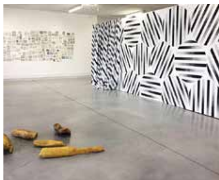
Exhibition Nos Doubles , Open School Galerie, Beaux-Arts Nantes