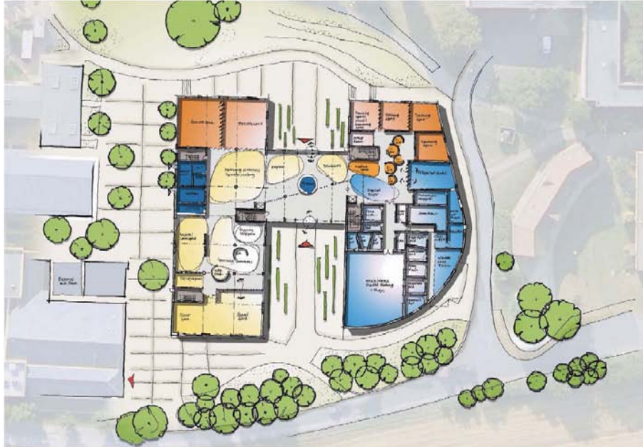
New Academic Building Ground Floor Plan